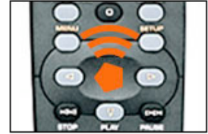
Full featured IR Remote Control