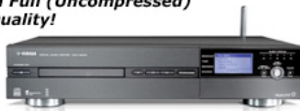
MCX-2000 *With Diamond Case Designs 750GB Hard Drive Upgrade Digital Audio Server

Capable of storing up to 1600 CDs in Full (Uncompressed) Quality!