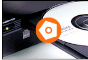
create your own CDs