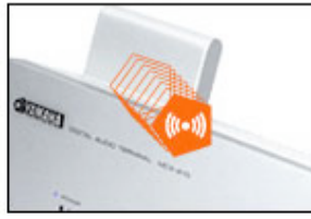
wireless music distribution